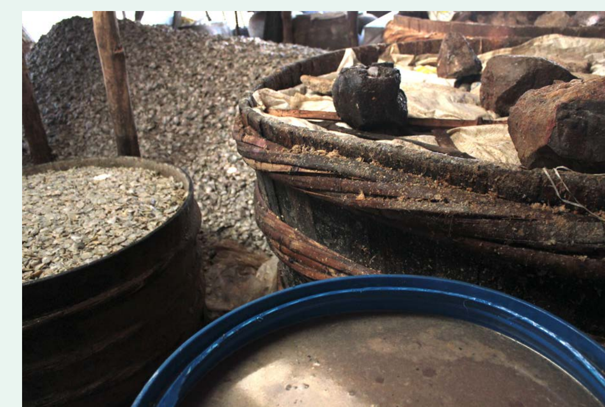
Fermented fish of various kinds provide a value added product in Cambodia.