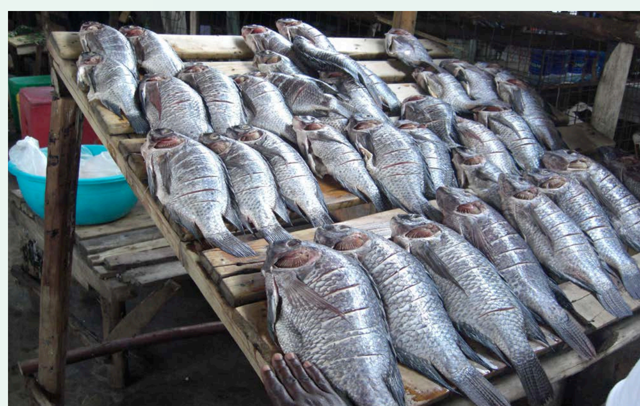
Tilapia on display and ready to grill at a restaurant in Kisumu, Kenya.

This poster showcases AquaFish CRSP investigations where US and host country researchers have worked together to study economic opportunities and constraints in aquaculture and fisheries to alleviate poverty and increase food security in Kenya, Uganda, Cambodia, Vietnam, the Philippines, and Guyana.