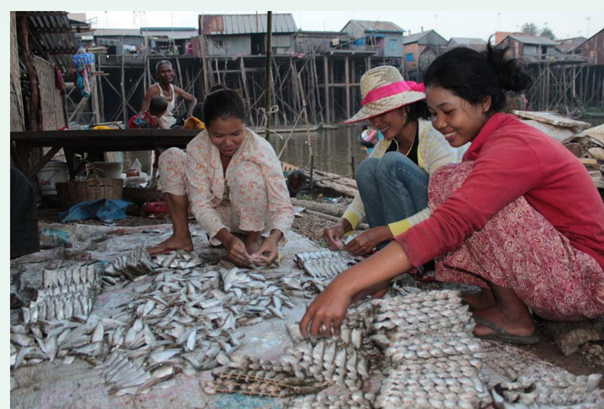
Women fish processors preparing fish for the smoker in Cambodia.