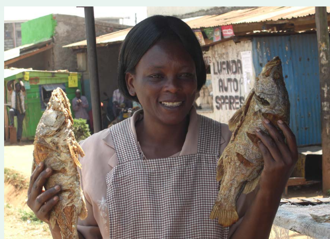
A street vendor selling tilapia on the outskirts of Lake Victoria in Kenya.