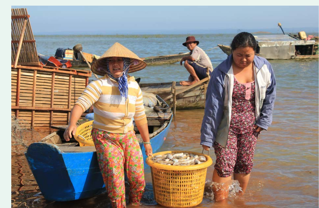
Women at a fish buying station along the Tri An Reservoir in Vietnam

LEAD US INSTITUTION: NORTH CAROLINA STATE UNIVERSITY