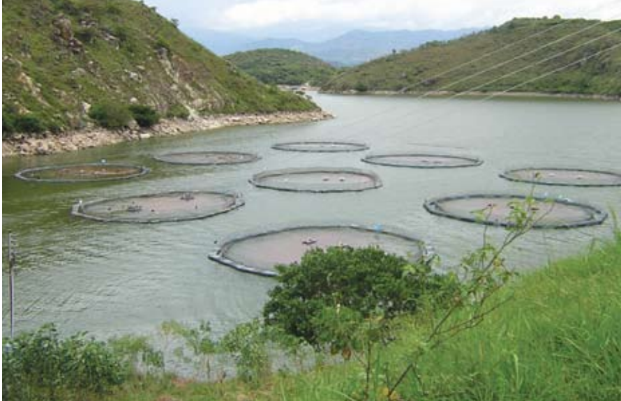
The size and scale of cage structures are defined by water velocity, stocking density and other factors.