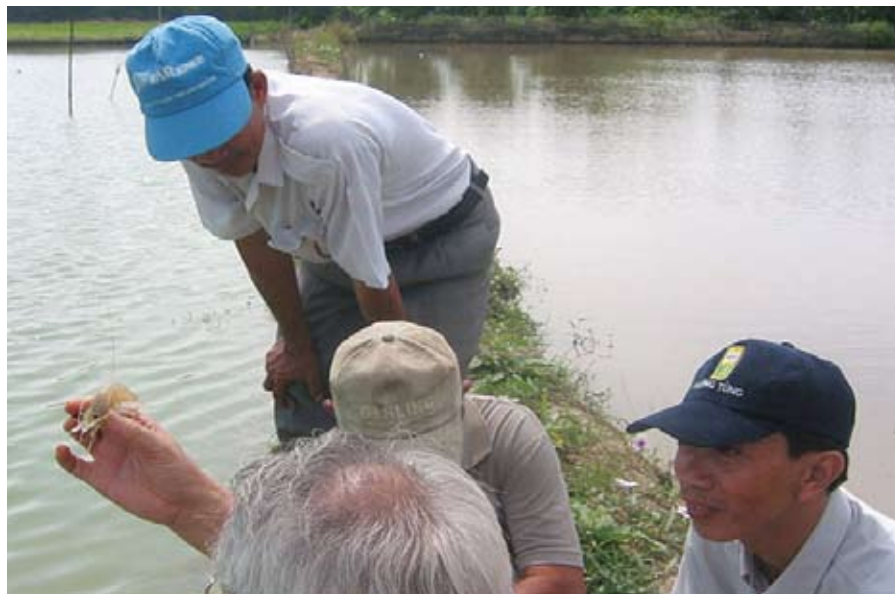
Farmers evaluate the growth of shrimp ponds in Thailand.