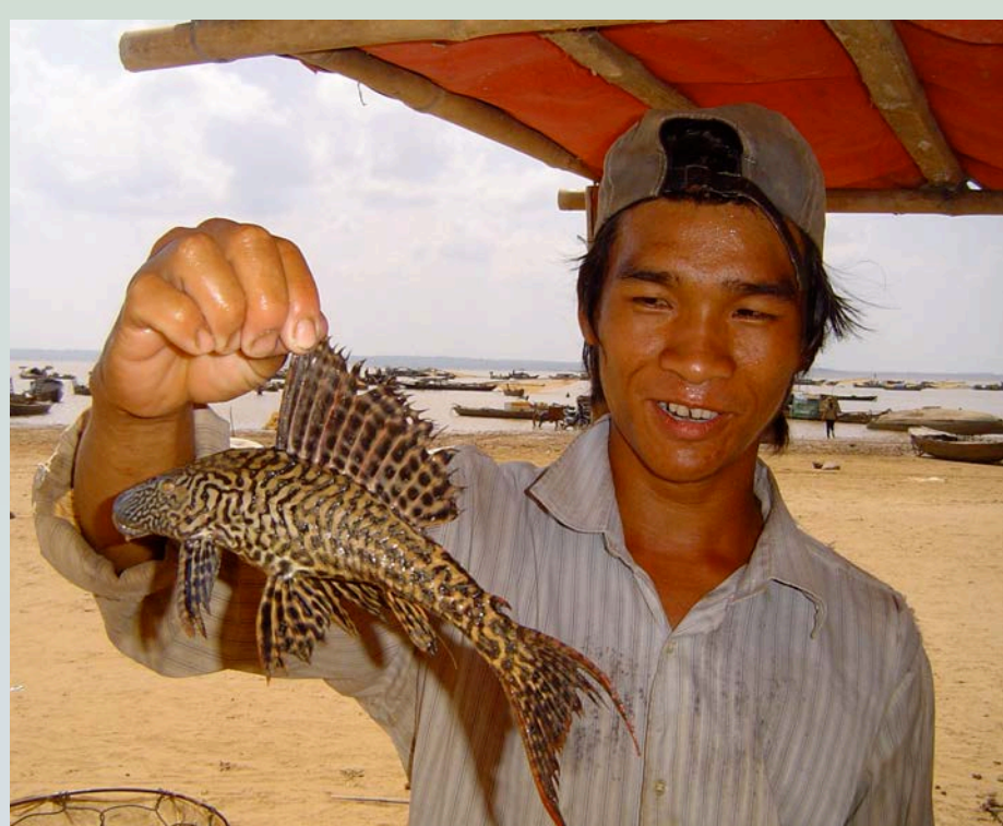
Alien fish species in Vietnam with no food value was accidentally introduced into freshwater reservoirs.

Mitigation of these adverse effects is key to developing sustainable, end-user level aquaculture systems. Several investigations within the AquaFish CRSP portfolio focus on sustainable solutions for mitigating or eliminating environmental impacts in Mexico, Cambodia, China, Indonesia, The Philippines, and Vietnam. Each investigation assesses a variety of ecological