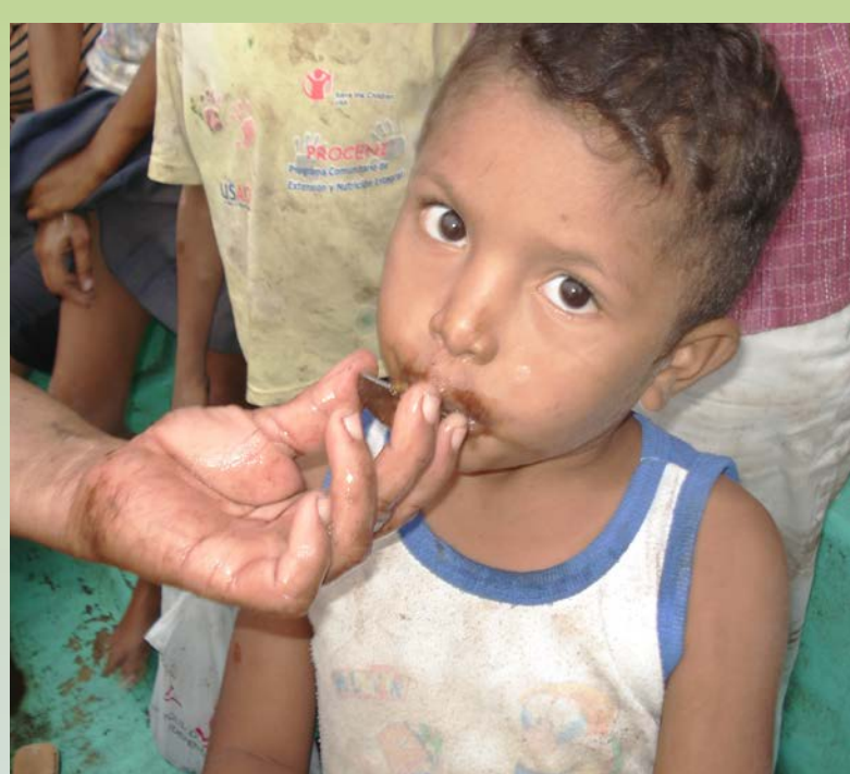
Eating native black cockles in Nicaragua

At the same time, the development of new native species for aquaculture must be approached in a responsible manner that diminishes the chance for negative environmental, technical, and social impacts. Under this topic area, AquaFish CRSP researchers work with several indigenous species in Mexico, Cambodia, Vietnam, Nepal, Nicaragua, and Ghana using best management practices to both support and protect natural stocks. Researchers in each of the countries are currently engaged in various stages of indigenous species production development, ranging from initial species evaluations and breeding experiments to on-farm production trials.