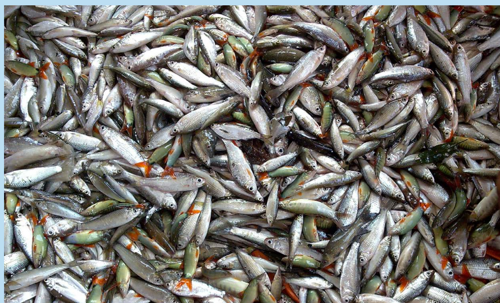
Over 59 species of wild small sized fish caught in Cambodia, relied upon both human consumption and aquaculture feeds. Researchers are working to decrease reliance on these fish for fishmeal to protect the fishery and to promote more sustainable feeding practices of small-scale fish farmers.

effects with the long-term goal of reducing the “ecological footprint” of aquaculture through best management practices, innovative sustainable technologies, and targeted trainings and workshops.