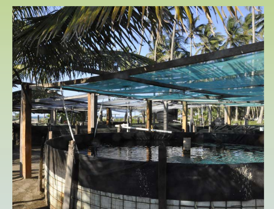
Ponds in Mexico used for the development of a snook breeding program