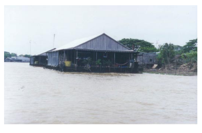
Fish culture cage operation in river at Dong Thap, Vietnam

traditionally used for land crops. By using the principle of traditional Chinese polyculture "one grass carp raises three silver carp," the study in Nepal will develop a polyculture system of grass carp and Nile tilapia with napier grass as the sole nutrient input. The outcome of this study will benefit resource-poor farmers in many other countries.