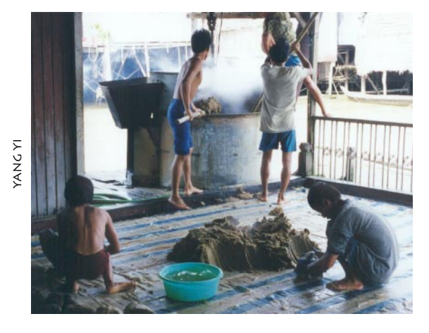
Feed preparation at top of cage, Vietnam

This issue of Aquanews highlights Tenth Work Plan activities planned by new and continuing CRSP partners in South and Southeast Asia. Since its inception in 1982, the PD/A CRSP has been involved in research in Southeast Asia, with Thailand and the Philippines its long-term partners. Research was conducted in Indonesia through 1987 as well. The Tenth Work Plan sees a tremendous expansion of the geographic scope of research throughout South and Southeast Asia, primarily through the Thailand Project. Partnerships have been forged